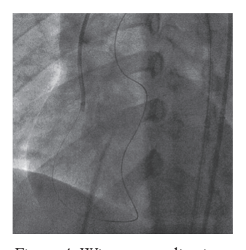
Figure 4. Wire externalization.