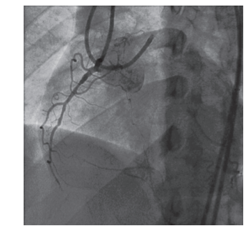
Figure 1. Dual injection to assess lesion length and proximal cap.

crossing or antegrade dissection less likely to succeed based on the hybrid algorithm. Given the favorable retrograde septal collateralization (Figure 2), the team decided to use a retrograde approach to wire the vessel and perform the intervention.