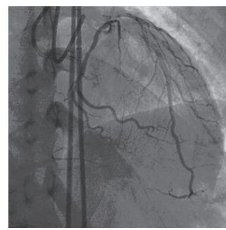
Figure 2. Septal collaterals from left anterior descending artery (LAD) to posterior descending artery (PDA).

segment (Figure 1), which would make antegrade true-to-true lumen