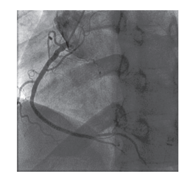
Figure 5. Final result with three drug eluting stents demonstrating good distal runoff.