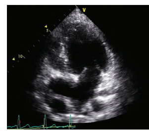
Figure 2. Post-operative echocardiographic image, apical four-chamber view.

At his most recent follow-up, the patient was doing quite well. His dyspnea and energy level had both improved and he was no longer having atrial or ventricular arrhythmias. Echocardiography demonstrated that his right atrium had returned to a normal size and that his LV function remained normal (Figure 2). His total bilirubin level had decreased to 1.7 mg/dL from 2.4 mg/dL at presentation. A liver ultrasound showed no significant fibrosis, and Hepatology is now following the patient regularly.